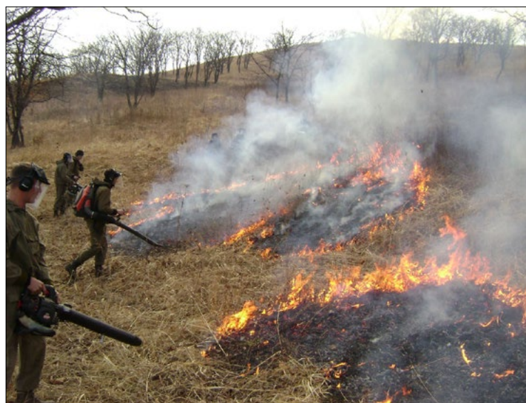
Burning crop waste is a deeply ingrained custom in rural Russia, but all too often fires escape to nearby forests. Recent pilot projects combining mobile fire brigades with fire education and community involvement have made dramatic gains.

In addition to that broad priority, the authors focused on three subregions—Chukotka, the Amur River Basin, and salmon ecosystems—and the conditions necessary for success in each of them. In Icy Riches , the focus is on the subsistence livelihood of the indigenous people in Chukotka. In One River, Three Countries , the focus is on the depth of conservation experience and high capacity in the Amur Basin. And in Salmon Strategies , it’s the opportunities for medium- to long-term transformational change possible through markets, sustainable fishing practices, and salmon councils.