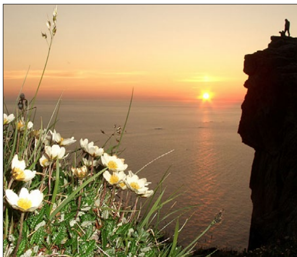
Mountain avens ( Dryas octopetala) grows on the shores of the Chukchi Sea.

Scientific monitoring and data sharing has already proved an effective way to reduce human impacts to these marine mammals. For example, Alaskan officials