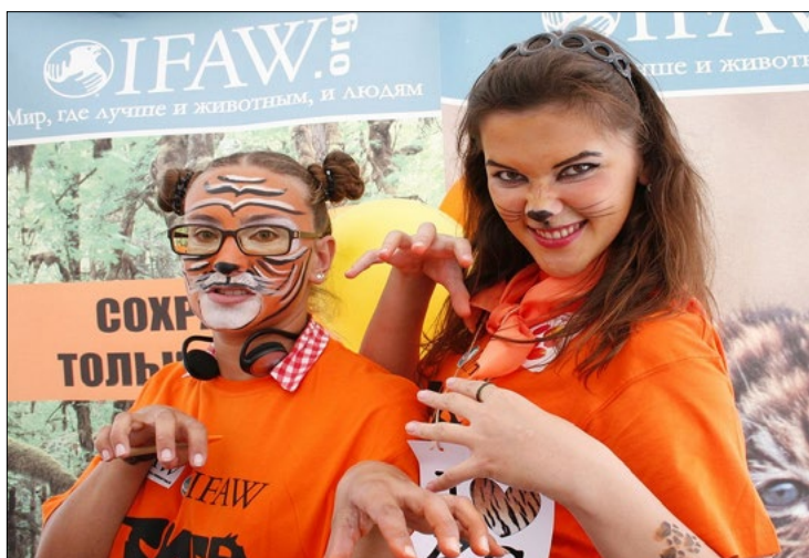
Tiger Day celebrations in Vladivostok and other Russian cities and towns have helped grow support for the endangered Amur tiger, which numbers only about 500 in the wild, but has rebounded in the past decade.

These important ecosystems face daunting threats—especially from expanding economies