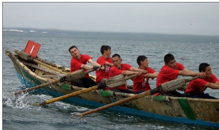
Every native village in Chukotka sends a crew to compete in the whaleboat regatta in the village of Lorino, where the Chukchi Sea meets the Bering Sea.

Since the 1990s, a vibrant and diverse environmental conservation movement has grown in Russia, and today conservation organizations work at all levels of society—from tiny “initiative groups” organized by villagers to protect local springs or forests, to indigenous tribes that oversee management of subsistence resources, to industrial fisheries that lobby for rational and fair use of resources. There are also international conservation groups,