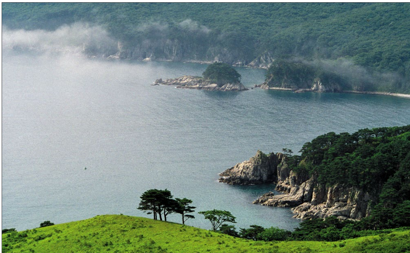
The Russian Far East is home to dramatic scenery as well as globally significant ecosystems.

in Russia. A campaign is under way to name this international protected area a united World Heritage Site.