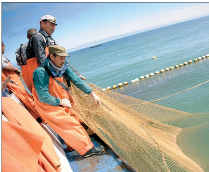
The Karaginsky Bay salmon fishery is the first in Eastern Kamchatka to launch a fisheries improvement project (FIP). Half the peninsula's wild salmon fisheries are now in an MSC-certification process or FIP.

THE RUSSIAN FAR EAST IS HOME TO ALMOST half the world's wild Pacific salmon ecosystems, and nothing defines the natural richness of the region and demonstrates its ecosystems' health (or lack thereof) more than salmon. Salmon are central to the diet of the top of the food chain—bears, owls, eagles, and humans—and central to