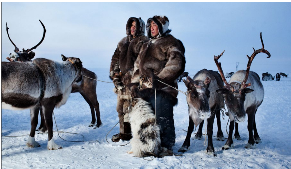
Reindeer herding is part of the subsistence livelihood of indigenous Chukotkans.