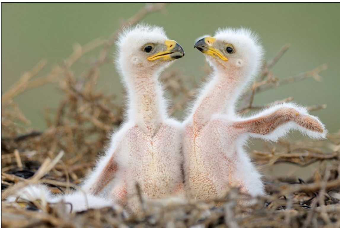
Eagle chicks in the steppe.

where else in the basin. Over a period of 25 to 40 years, the climate alternates between wet, cool periods and dry, hot periods, between floods and droughts. In wet periods, ducks, grebes, and water hens make their homes in the lakes and dirt banks. The sandpipers move in as the drought takes hold. At the height of the dry season, larks nest on the parched lake bottoms.