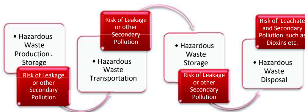
Figure 16: Hazardous Waste Pollutant Risk

Many of Apple’s suspected suppliers are producing huge quantities of hazardous waste, so improper disposal of the waste would create a serious hazard. The first “Other Side of Apple” report raised the problems of Lianjian (Wintek) Suzhou “not adopting the appropriate measures which resulted in hazardous waste run-off.” In the course of this investigation we found more problems of this kind at suspected Apple suppliers.