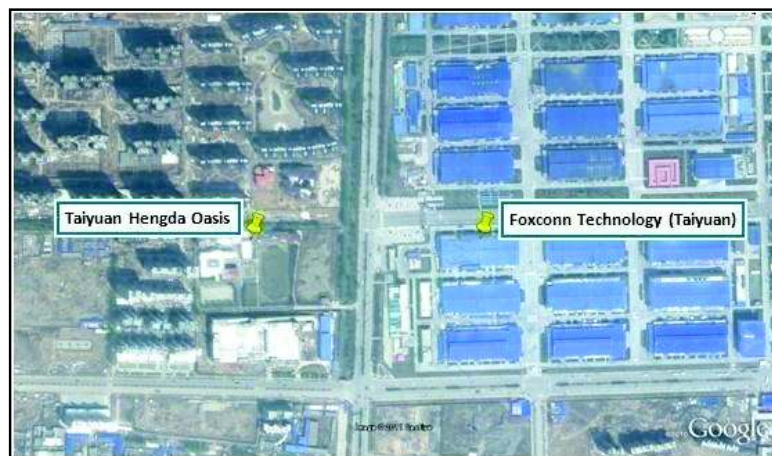
Figure 14: Google Earth Satellite image of Foxconn (Taiyuan) and the residential area Hengda Oasis.

Foxconn Technology Co., Ltd. is located at Foxconn Industrial Park, No. 23 Dianzi Street, Xiaodian District, Taiyuan city and is mainly engaged in the production and processing of components for mobile phones and notebook computers. Within this park, four production projects have been constructed, respectively; magnesium alloy 3C electronic mechanism surface treatment project; magnesium alloy 3C electronic mechanism surface treatment extension project; 24,000,000 set mobile phone components engineering project, 3C production supporting set radiator series product fabrication extension engineering project.