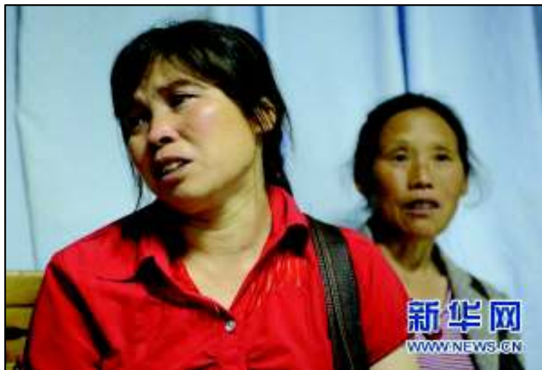
Figure 23: May 21 st , Victim of Foxconn Explosion in the Emergency Room Receiving Treatment, father of the patient to the right.