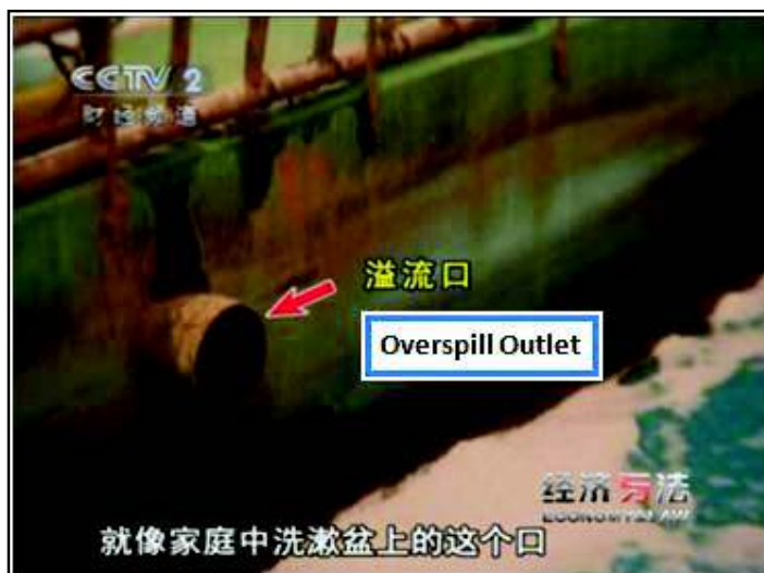
Figure 3: Overspill outlet adjusted over the pool

On April 12th, 2011, Guangdong Provincial Environmental Protection Department issued the “Publication of 2008 Assessment Results for the Key Pollution Sources Environmental Protection Credit Management Plan.” The results of the assessment showed that Meiko Electronics (Guangzhou Nansha) Co., Ltd. was still rated as ‘Yellow’ 12 meaning that their environmental problems had still not been completely resolved.