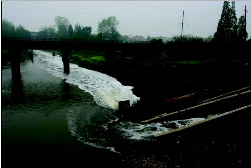
Figure 8: Discharge Outlet Used by Meiko Electronics & Chenming Paper Companies

On June 2 nd , 2011, the lawyer from the Wuhan branch of Friend's of Nature, Zeng Xiangbin, and the Pony Testing Company got the test results from the sampled milky white water from the drainage channel leading to Nantaizi Lake. The results showed that the COD Cr concentration was 192 mg/L, which is 4.8 times the Category V (40mg/L) 20 Environmental Surface Water Quality Standard. The copper content here is believed to be between 56-193 times the amount of copper found in the sediment in the middle reaches of the major lakes of the Yangtze River.