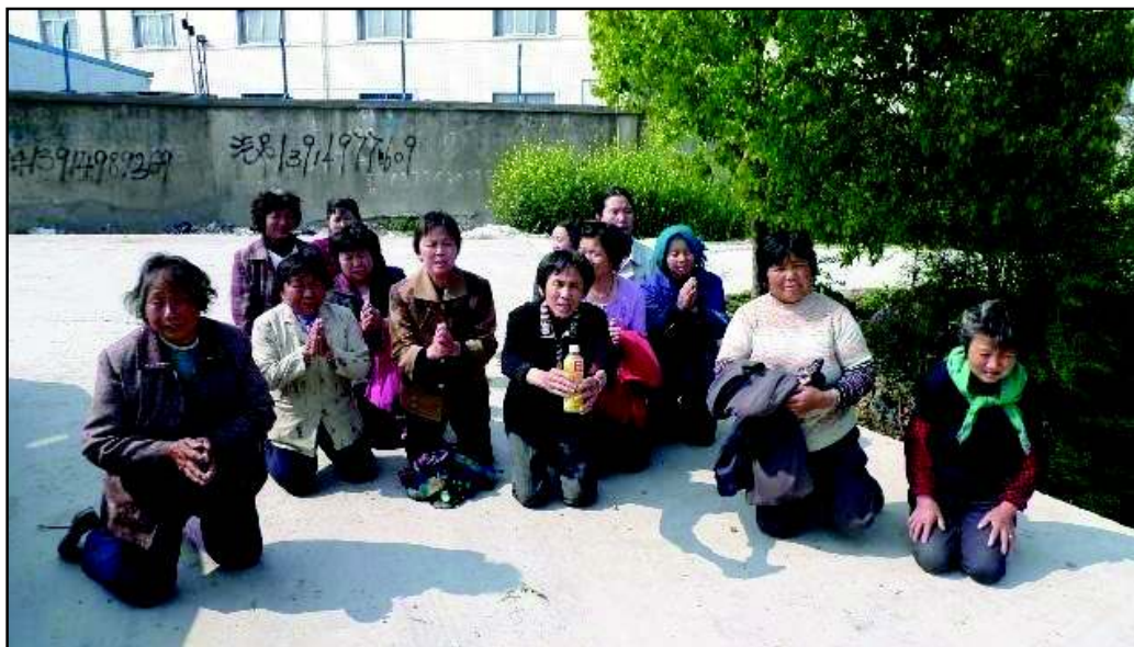
Figure 12: During the investigation the villagers suddenly dropped to their knees and asked for help.

Afterwards, the Tongxin village residents provided us with a statistical chart of local residents with cancer. At the end of May 2011, we again visited Tongxin village, specifically to verify the situation of cancer patients. We found that since 2007, from just the No.8 section of Tongxin Village, the number of people who have suffered from cancer or died from cancer was more than nine, and the total population of the section of the village was less than 60.