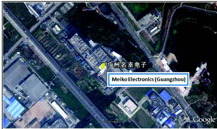
Figure 2: Satellite image of Guangzhou Meiko Electronics (suspected Apple Inc. supplier)

On February 23 rd , 2009, the '2008 Assessment Results for the Key Pollution Sources Environmental Protection Credit Management Plan,' issued by the Guangdong Provincial Environmental Protection Bureau, showed the evaluation results for Meiko Electronics (Guangzhou Nansha) Co., Ltd. to be an 'Environmental Protection Credit Management - Enterprise under Strict Environmental Protection Supervision (Rated - Red).' 5