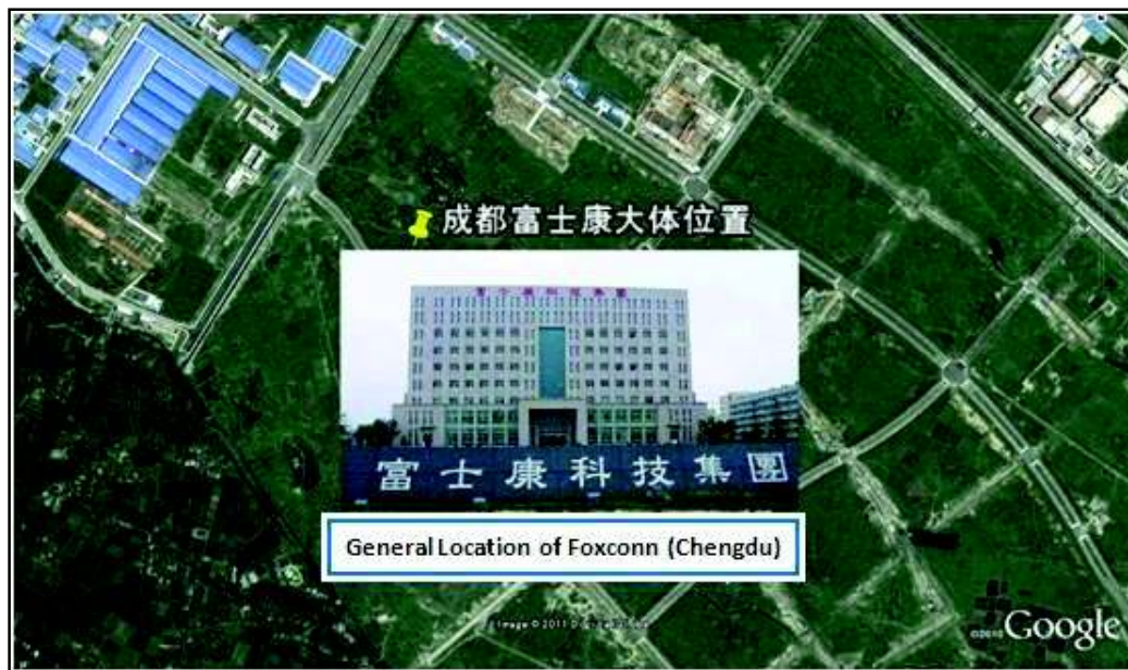
Figure 21: Satellite Image of the General Location of Foxconn Chengdu.

Building at such a hasty speed must mean that pollution control and production safety present huge challenges. According to the accounts given to the media by workers from the polishing workshop, equipment started being installed in the workshop in December 2012, and production was taking place whilst the machines were being installed. The machinery was fully installed in January 2011. “We really didn’t realize before that dust could cause explosions, the work of dust elimination was given to those employees with more experience.” 79