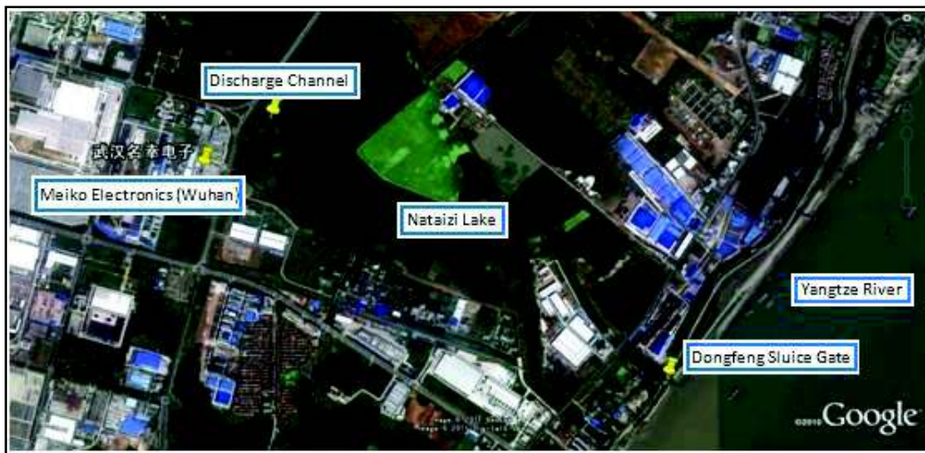
Figure 4: Wuhan Meiko Electronics, Discharge Channel, Nantaizi Lake, Dongfeng Sluice Gate Google Earth Satellite Image