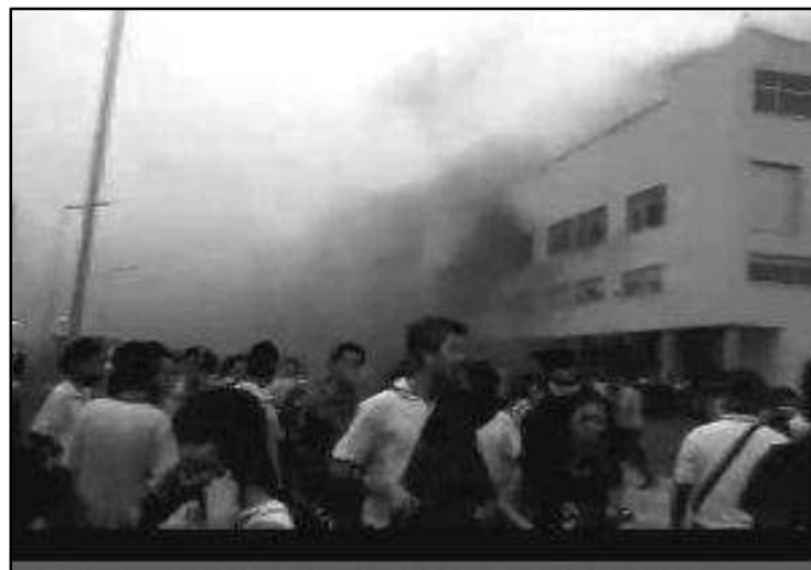
Figure 20: Explosion at Foxconn Chengdu’s iPad2 Polishing Workshop Production Line (Picture Shared Online)

At around 19:00 on May 20 th , 2011, there was a large explosion during production in the polishing workshop along the production line of the iPad 2 at Foxconn’s Hongfujin Chengdu factory. The explosion resulted in the death of two workers and injuries to 16 others. Not long after, another of the workers died from their injuries, bringing the total number of dead to three. 74