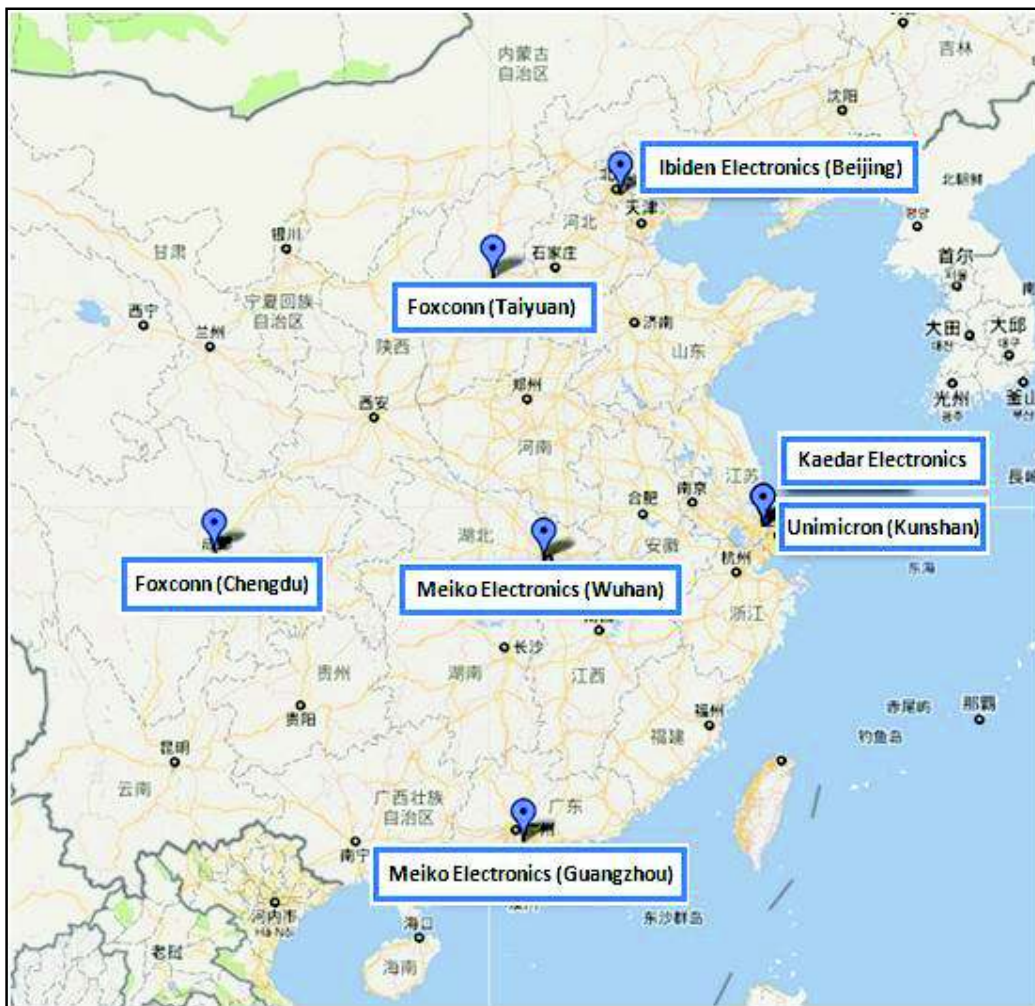
Figure 1: Mapping of some suspected Apple suppliers

Faced with an ever evasive Apple, a group of Chinese NGOs decided to dig deeper and carry out further investigations into the environmental problems that exist within Apple's supply chain. Through five months of research and field investigations we have found that the pollution discharge from this $300 billion dollar company has been expanding and spreading throughout its supply chain, and has been seriously encroaching on local communities and their surrounding environments.