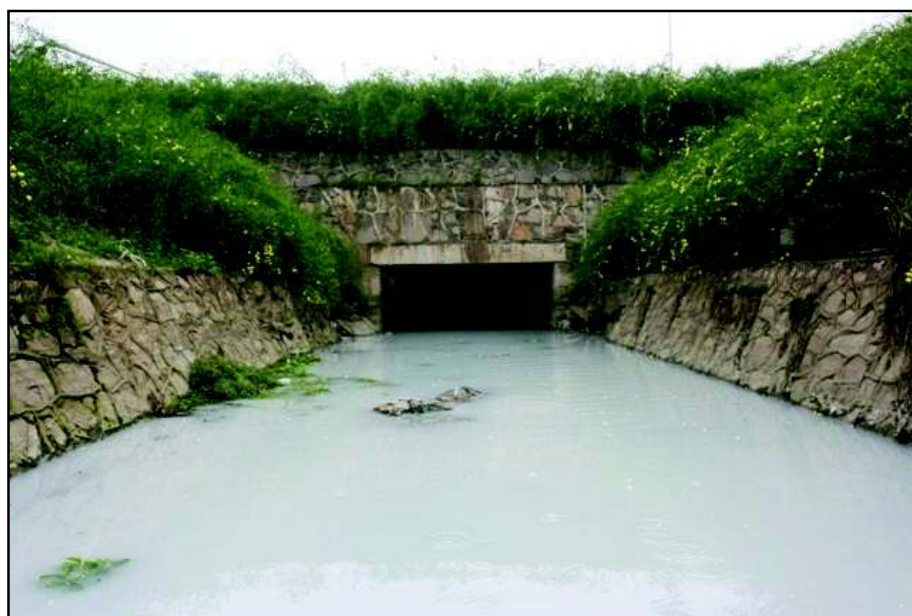
Figure 7: Discharge Channel's Wastewater Sample Inspection Results